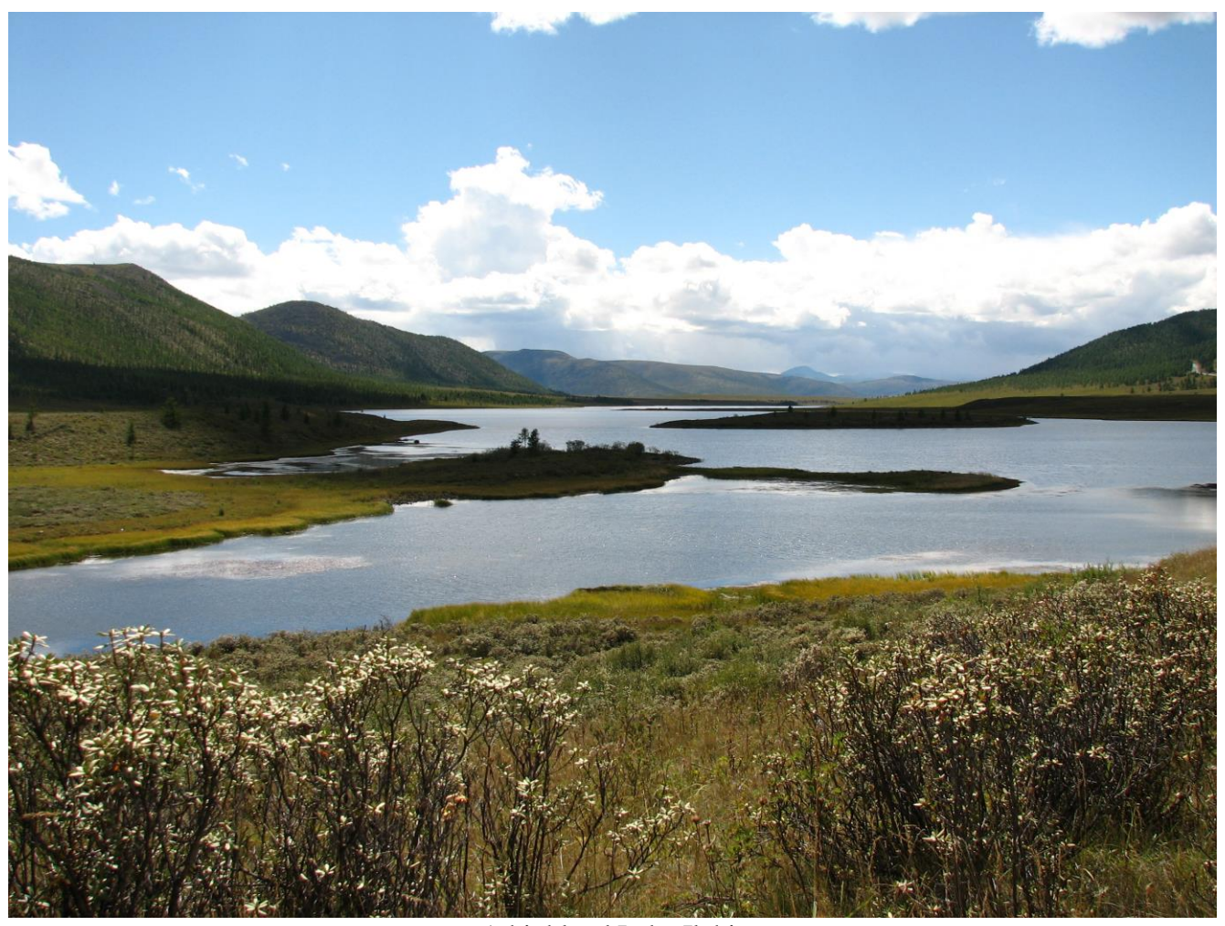
A highland Lake Ilchir

- a hiking tour to the Tunkinskiy Mountain Ridge on lake Khobokskoye.