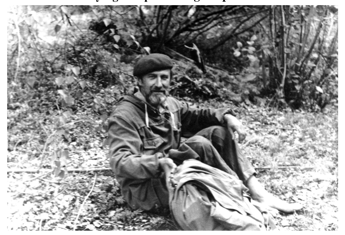
INFORMATION CIRCULAR №2

"Problems of studying and preserving the plant world of Eurasia"